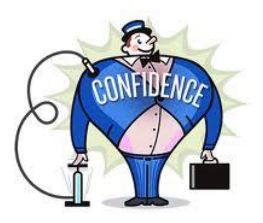
I for a story about purpsing up ones confidence