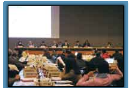
Participants at the STDF workshop on capacity evaluation tools

For more information, see: www.wto.org/english/news_e/news08_e/sps_31march08_e.htm