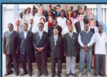
Participants at the Kampala workshop

A full report on the workshops will be made to the SPS Committee and STDF Working Group in the week of 23 June. For further information, go to: www.standardsfacility.org/regional_consultations.htm