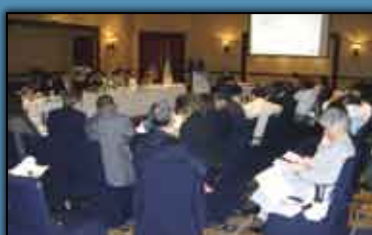
Participants at the Guatemala City workshop