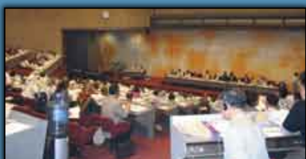
Codex in session

30 June-5 July, Geneva: Codex Alimentarius Commission